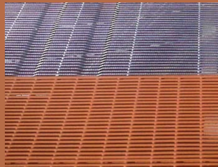
Dura Trac® Clearspan Creep Side in welded rod with galvanized triangular rod center